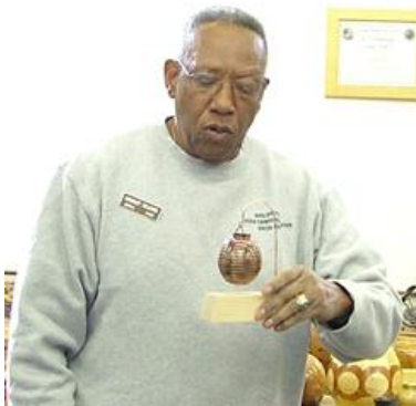
Charlie's segmented Ornament