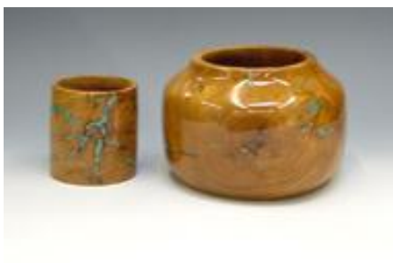
Charlie's Peach & turquoise Vessels