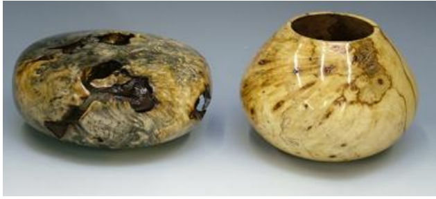
Dan O's Buckeye hollow forms