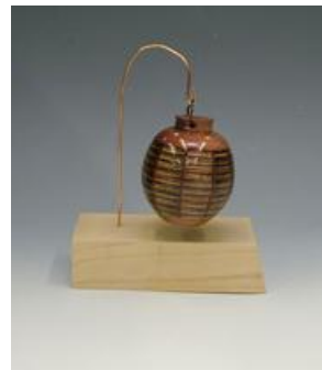
Charlie's segmented Christmas ornament