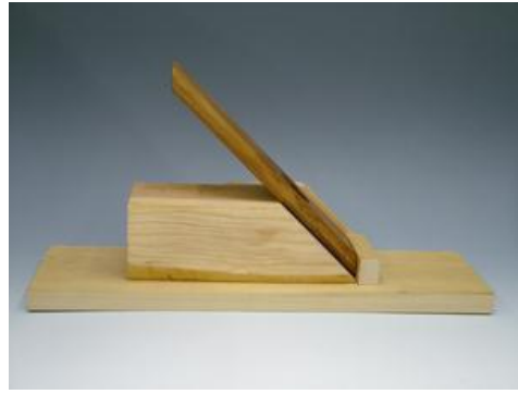
Mickey Burns' bottle balancer jig