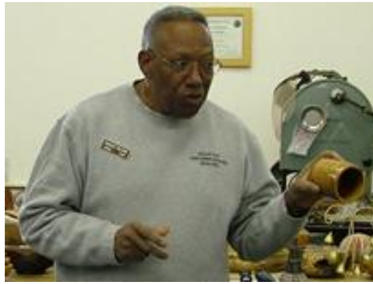
Charlie's Peach pencil holder