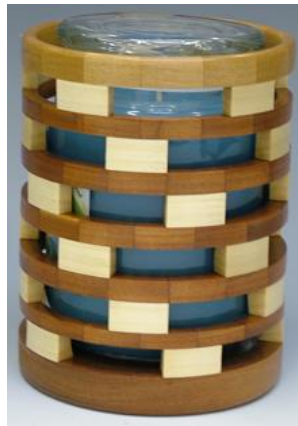
Wayne's candle holder