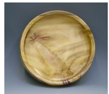
Corkey's Maple platter