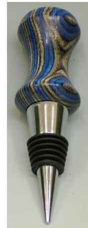
Mickey Dyke's bottle stopper