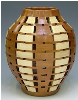
Wayne's open segmented Vessel