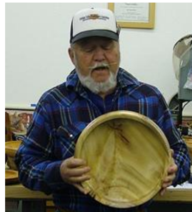
Corkey's maple platter