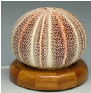
Mickey Burns' urchin Night light