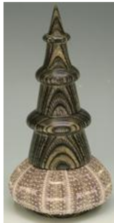
and urchin tree topper