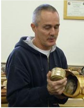
More unique woods