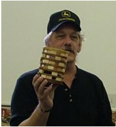
Wayne's candle holder