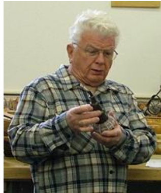
Mickey's sea urchin Ornament