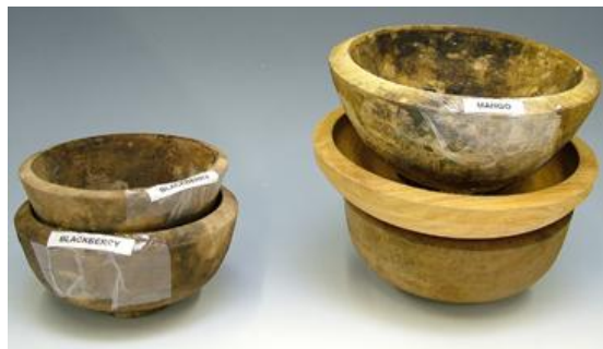
Native Philippine woods (rough outs)