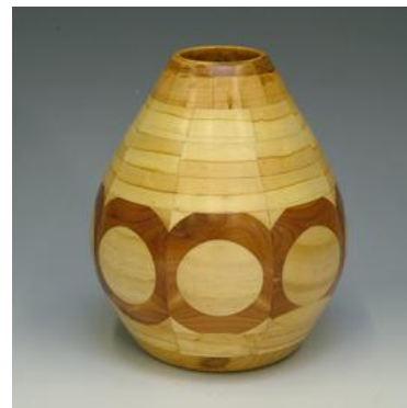
Wayne's segmented hollow form