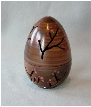
Steve's Pierced Walnut Egg