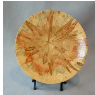
Steve's Dyed Ambrosia Maple Platter