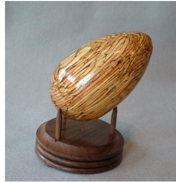
Steve's Paralam Egg on Stand