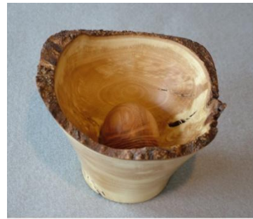
Dave's Pillispuro nat. Edge Bowl W/ Egg