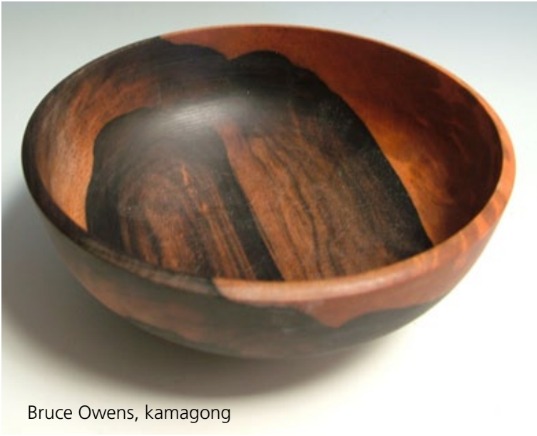
Bruce Owens, kamagong