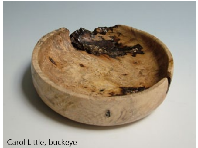
Carol Little, buckeye