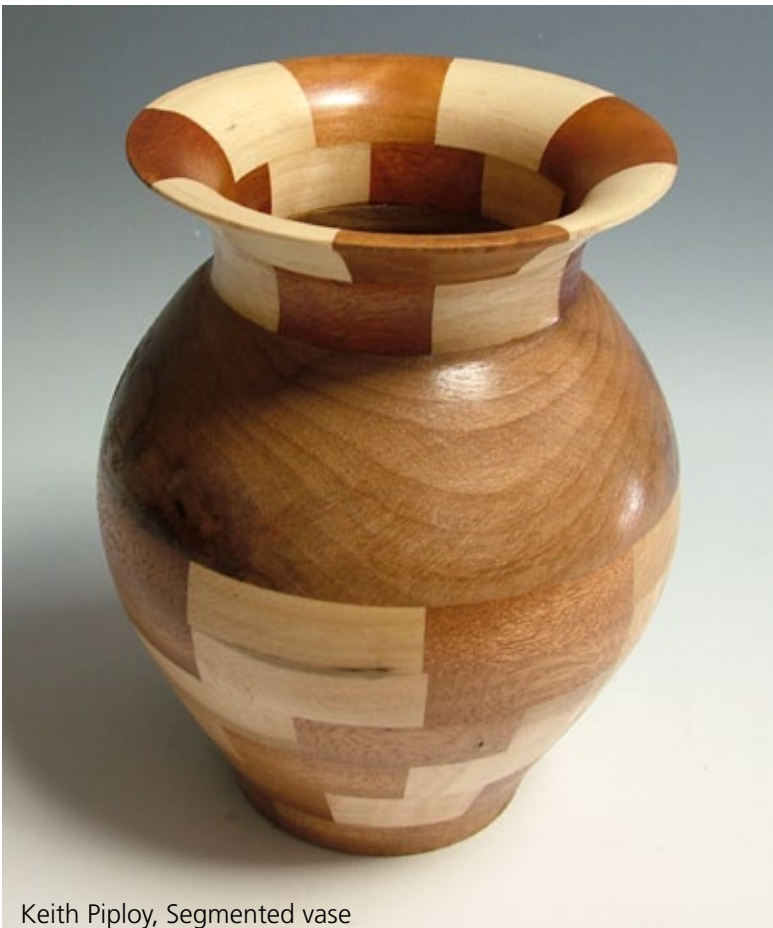
Keith Piploy, Segmented vase