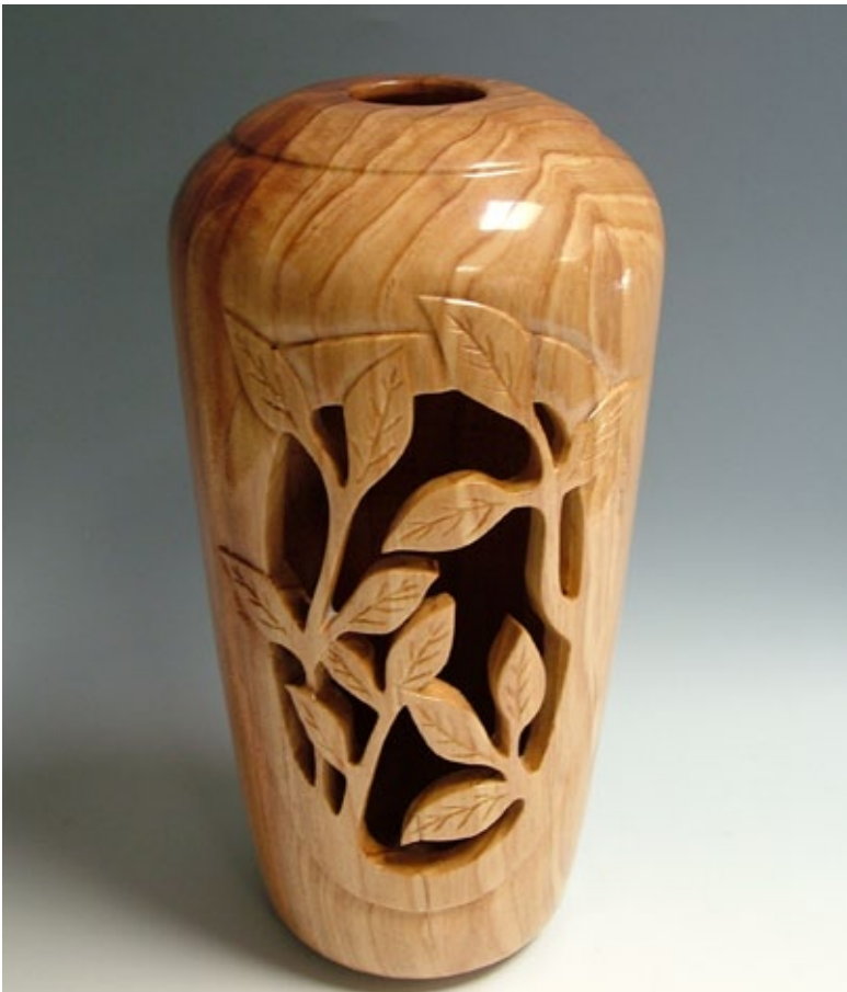
Dan Oliphant, redwood