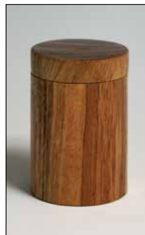
Dave Acuna, Albeasia toothpick holder