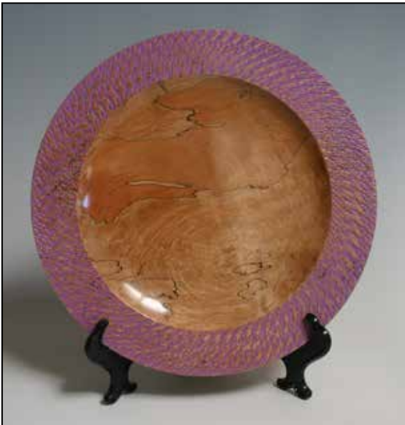
Bob Clarke, Silver Maple platter