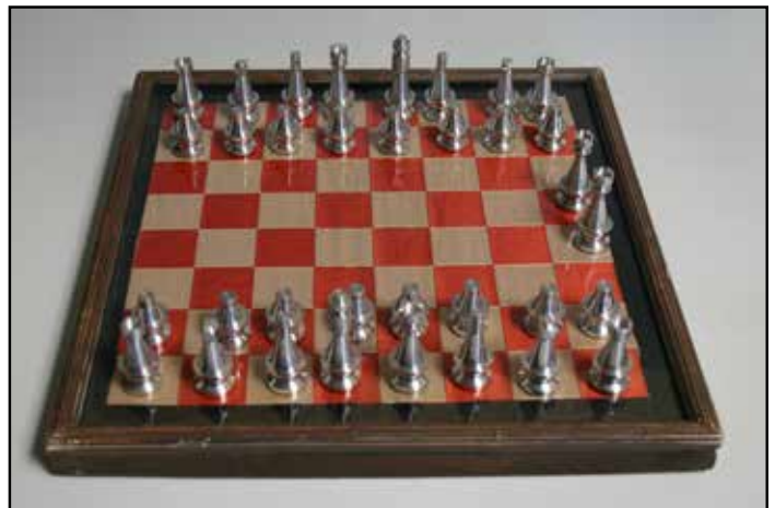
Mickey Burns, Aluminum chess set