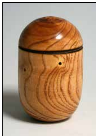
Dan Yost, Sycamore lidded box