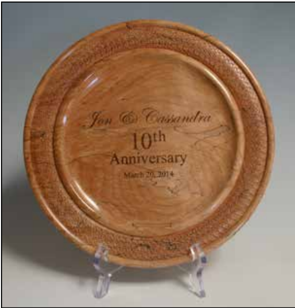
Bob Clarke, Silver Maple platter