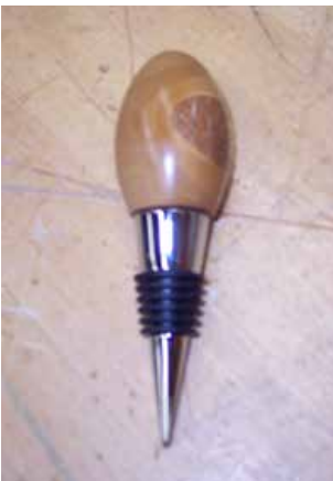
Very Nice Bottle Stopper by a member who's name I do not remember but it's great work