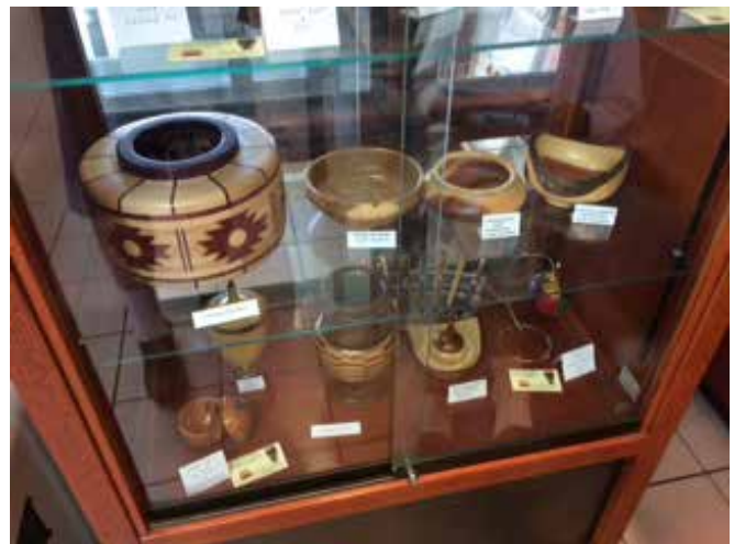
The AVWA display at the Lancaster Public Library