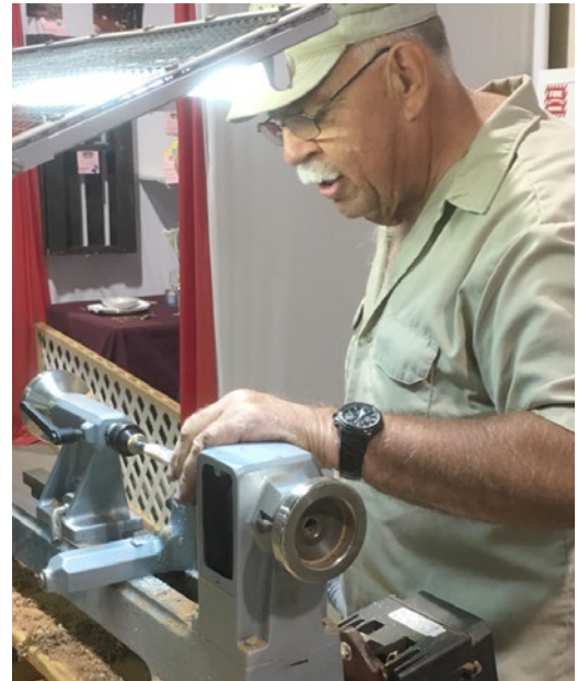
The AVWA demonstrations at the Antelope Valley Fair.