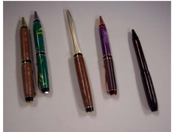
Pen and Letter Opener Acrylic and Wood; CA Glue finish Charles Roark