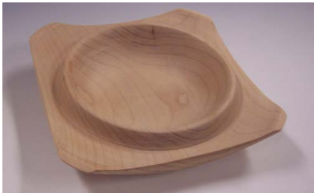
Winged Bowl/platter Maple wood Charles Roark