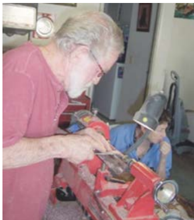
Last Years Freedom Pens Turn-a-Thon