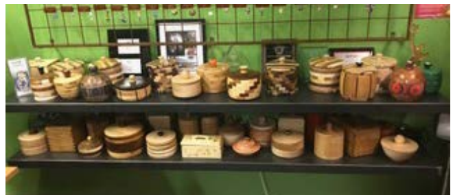
Last Year's Beads of Courage Program: We All Did Great