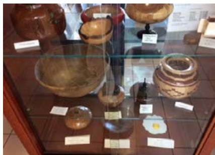
Last Year's Library display